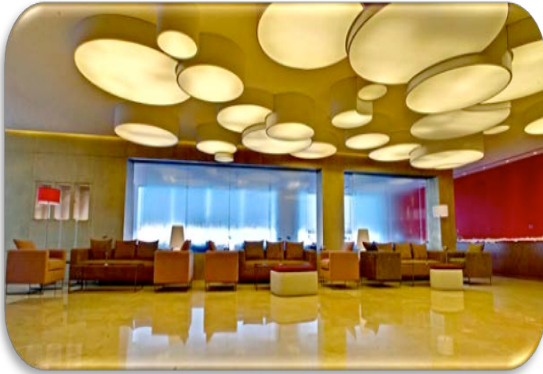
Free Internet At The Lobby