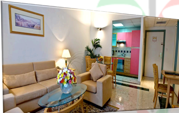
Apartment "Triple room" (1 single room + 1 double room and 2 bathrooms).