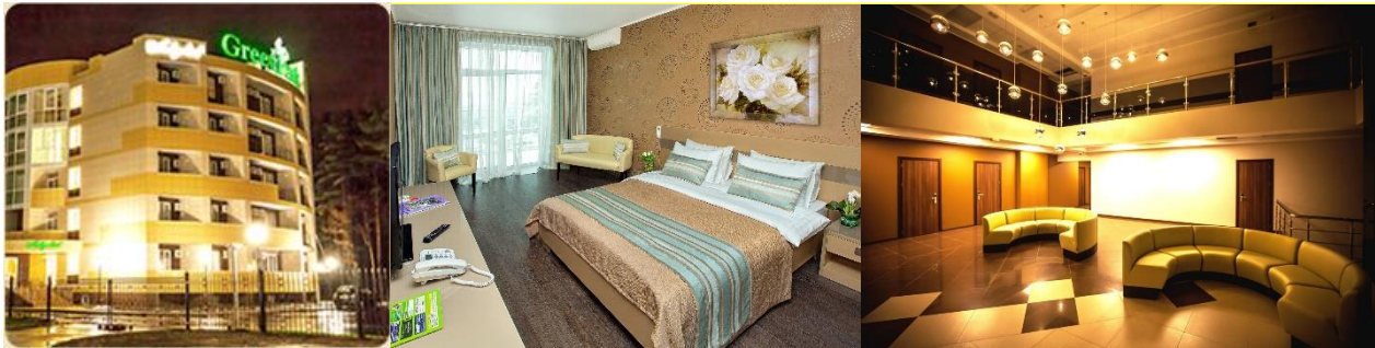
Hotel GREEN PARK