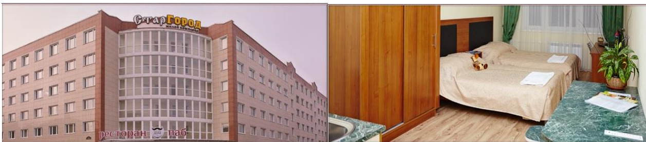
Hotel OLD TOWN

Note: on the ACCOMMODATION RESERVATION FORM below you will find the prices for accommodation. Each hotel is able to provide meals, which is paid separately. Last year official hotel was a hotel "OLD TOWN" as same as 2016.